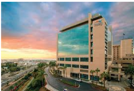
Hoag Hospital Newport Beach, CA

The Hoag Founders filed suit in May 2020, to regain control of Hoag Hospital, one of Orange County's most trusted health care networks, and re-instate their independence from Providence Health.